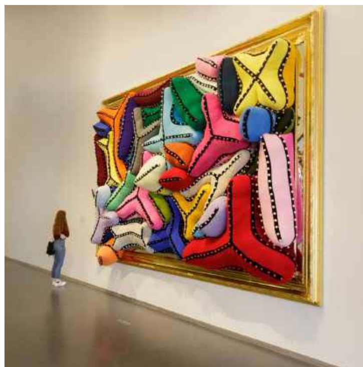
Finisterra (2018) by Joana Vasconcelos

She is the first woman and the youngest artist to exhibit at the Palace of Versailles, in 2012. Highlights of her career include a solo exhibition at Guggenheim Museum Bilbao, the project Trafaria Praia , for the Pavilion of Portugal at the 55th Venice Biennale; the participation in the group exhibition The World Belongs to You at the Palazzo Grassi/François Pinault Foundation, Venice (2011); and her first retrospective, held at the Museu Coleção Berardo, Lisbon (2010).