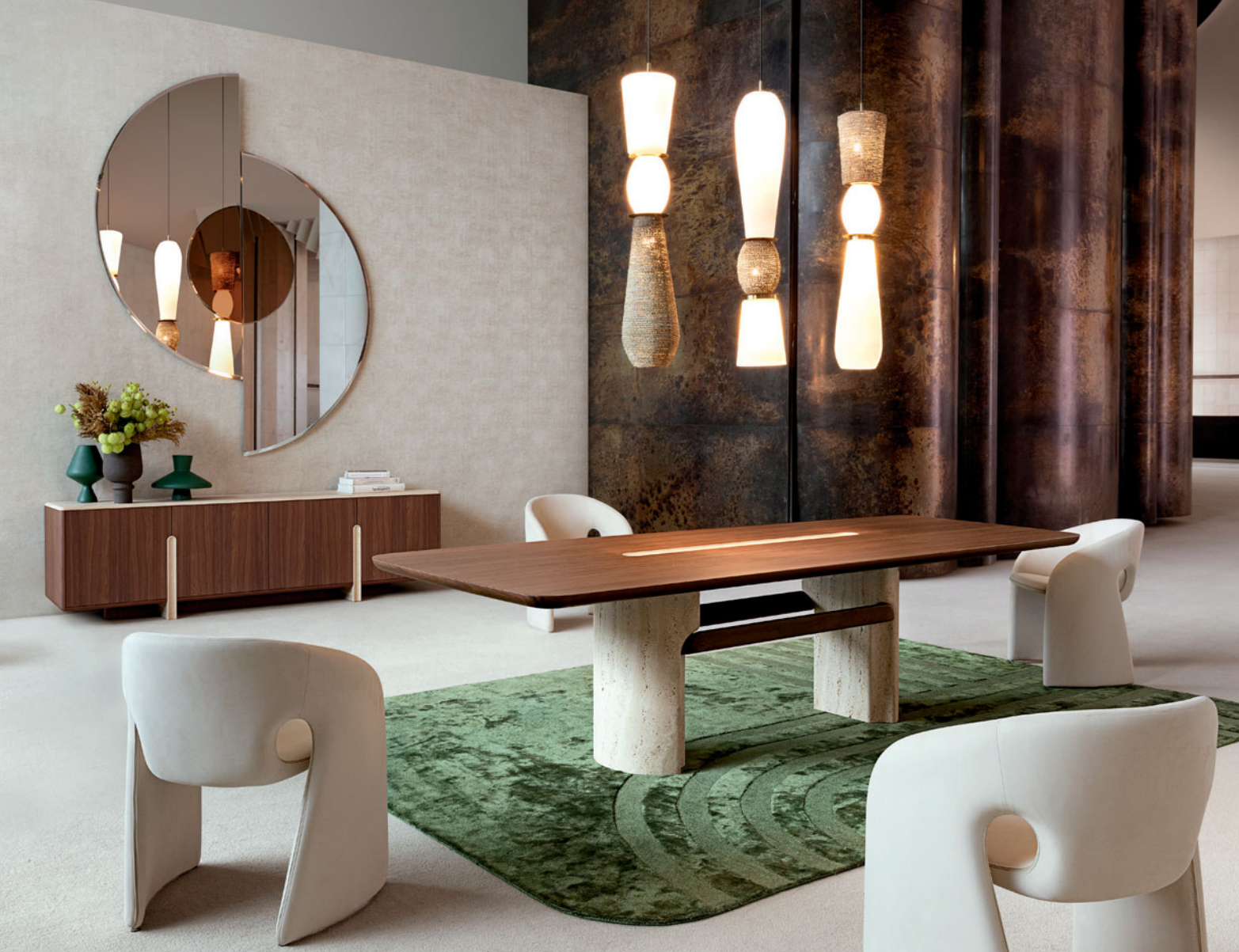
Palatine - designed by Christophe Delcourt Dining table and sideboard in walnut and travertine