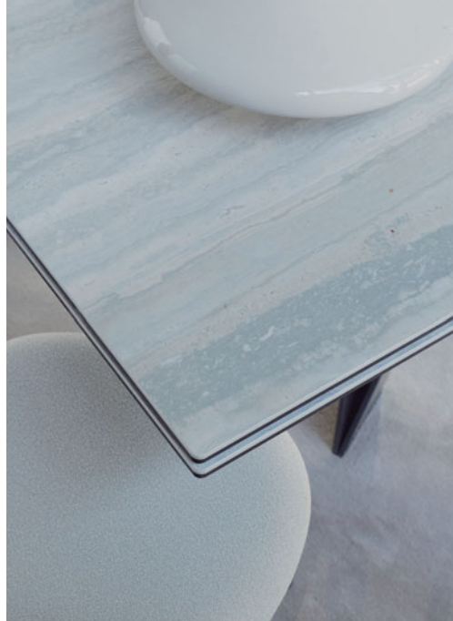
Cigale - designed by Andrea Casati Dining table with integrated extensions, glass and ceramic top