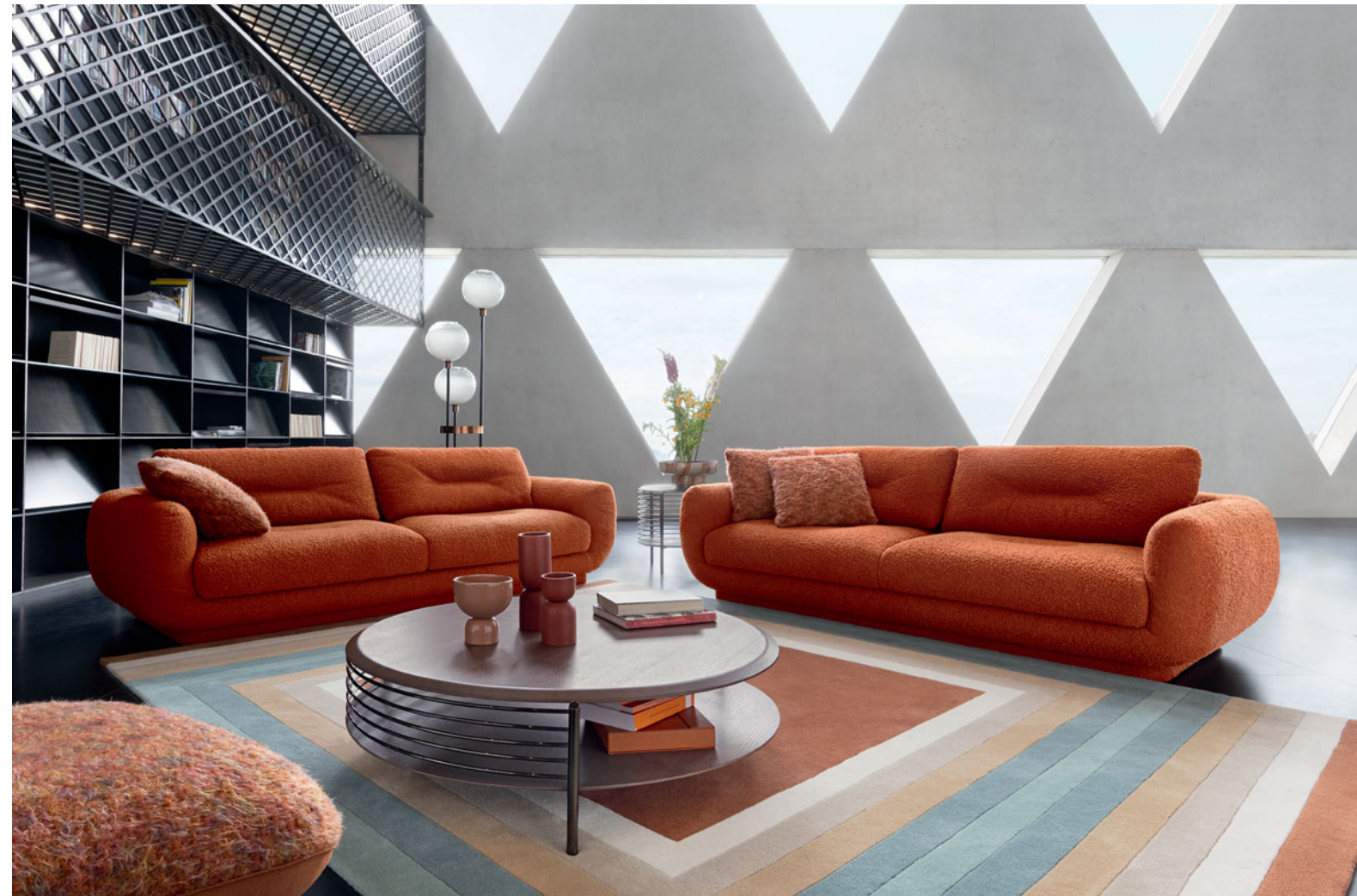
Intemporel - designed by Maurizio Manzoni 3-4 seater sofa, adjustable backs