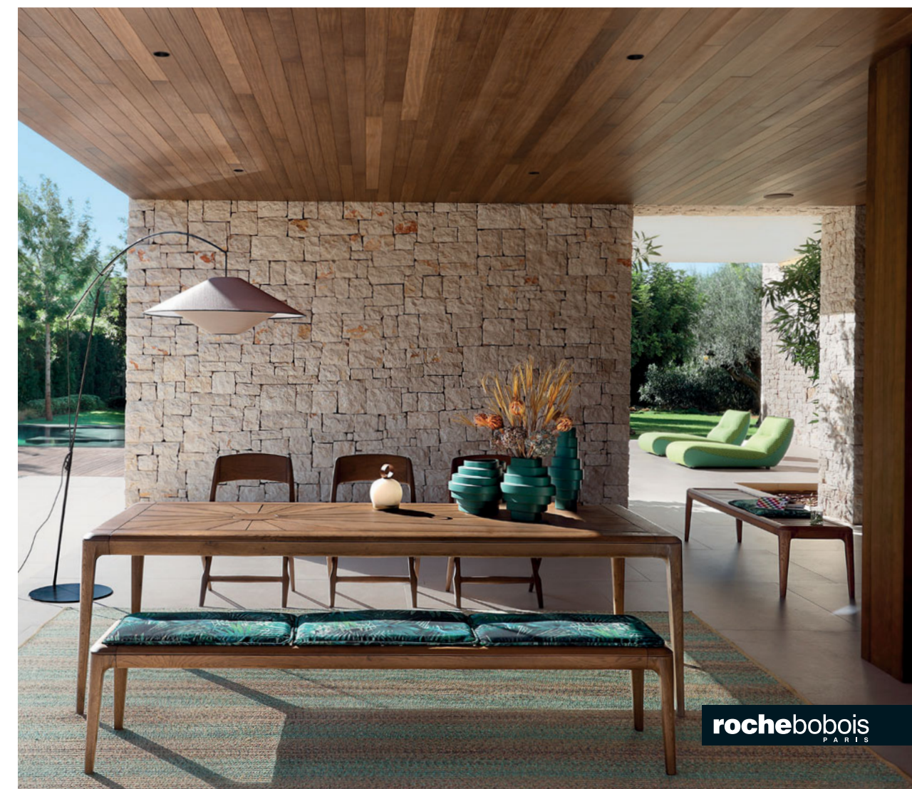
Auréa - designed by Sacha Lakic Outdoor dining table, reclaimed solid oak top