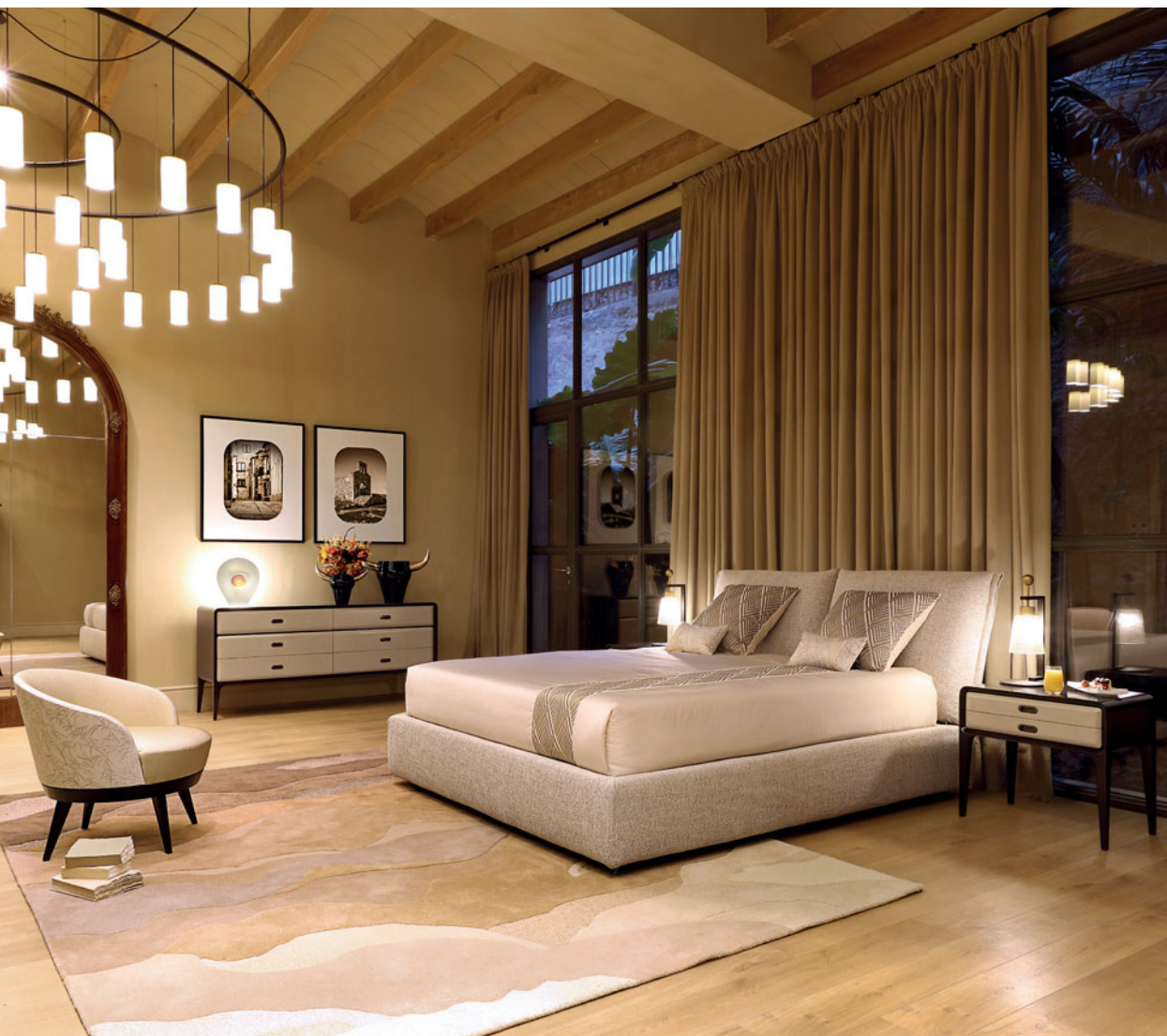
En-tête. Bed. Upholstered in Belize fabric. L. 172 x H. 113 x D. 230 cm for 160 x 200 cm mattress size. Other dimensions available. Storage compartment, deco cushions and bedding set available as an option. Offing dresser and bedside table , designed by Sacha Lakic. Exploration armchair , designed by Philippe Bouix. Preston table lamps , designed by Pierre Dubois & Aimé Cécil. Made in Europe.