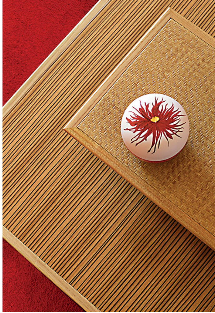
Platform tops in Alpi® Zebrano, frames and backrests in solid oak. Matching cocktail tables.