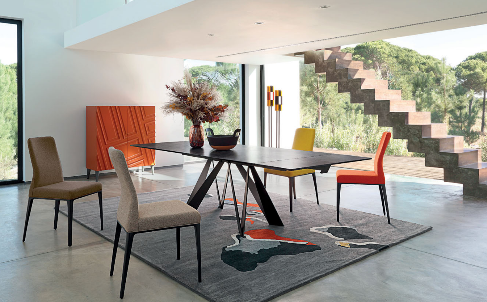
Cigale - designed by Andrea Casati Dining table with integrated extension leaves, top in glass and ceramic