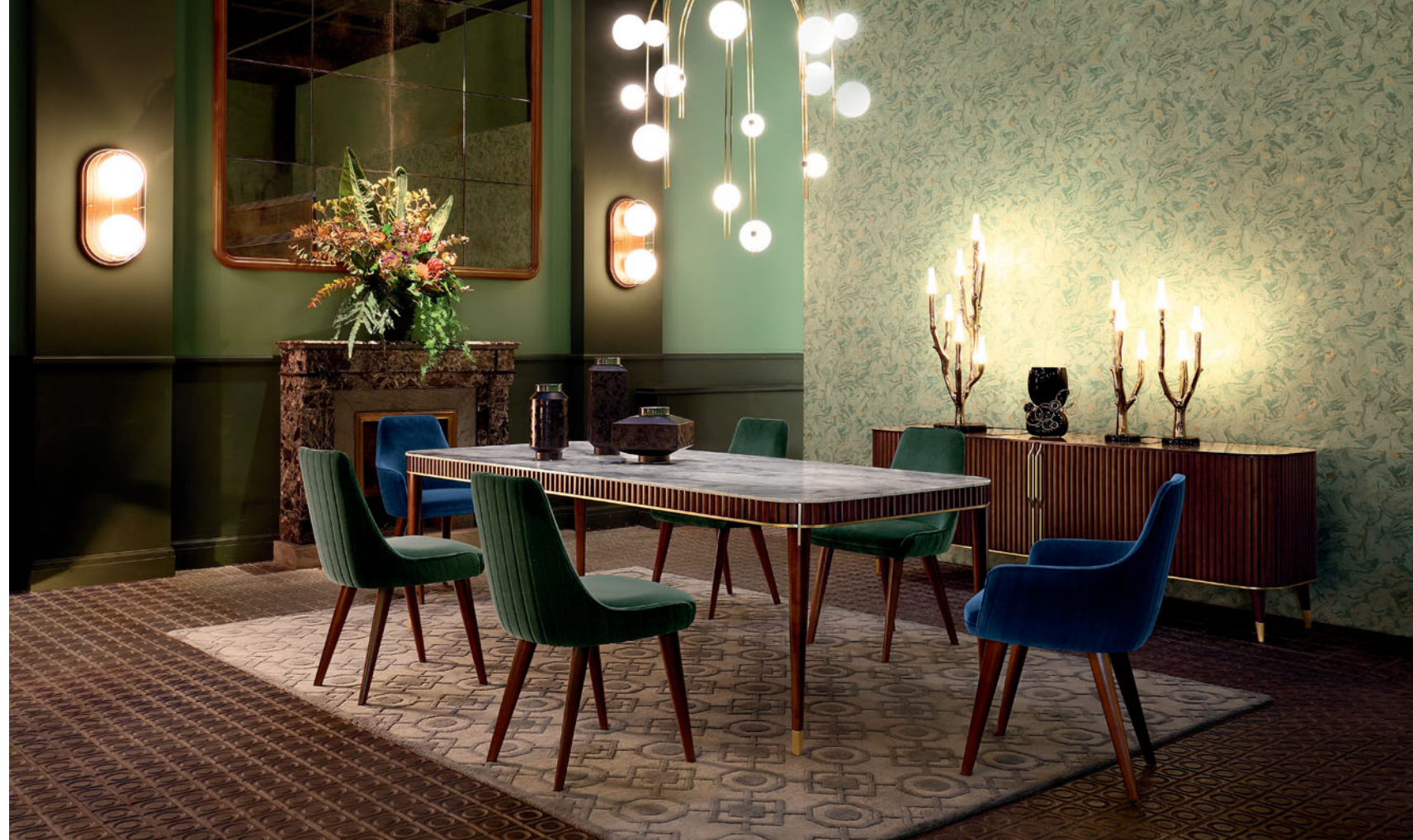
Eden Rock - designed by Sacha Lakic Dining table, carrara marble top