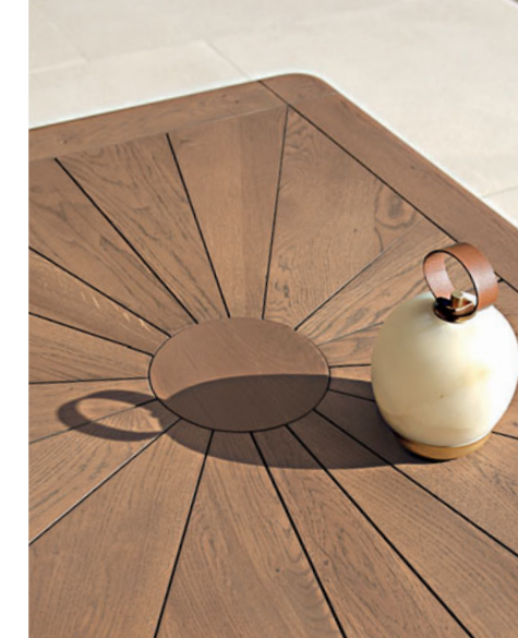
This collection is made using solid oak wood from former freight cars that once transported mineral water, now newly reclaimed and reworked.

Auréa. Dining table. Structure in reclaimed solid oak from former freight cars with sun pattern. L. 200 x H. 75 x D. 100 cm. Other dimensions available. Folding chairs , L. 58 x H. 89 x D. 57 cm. Bench , L. 200 x H. 45 x D. 45 cm. Pékin outdoor floor lamp , designed by Gabriel Teixidó. Tresse outdoor rug . Made in Europe.