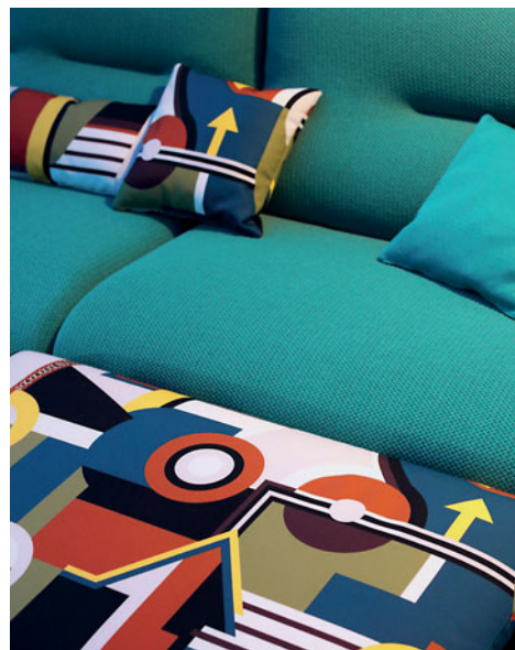
Constructivisme outdoor fabric by Jean Paul Gaultier.

Temps Calme Outdoor. Modular sofa upholstered in tufted and plain Méridien outdoor fabrics. Modular system with endless combinations of armless chairs, square corner units and ottomans. Seat and back in Dryfeel polyurethane foam and polyester fibres. Other elements and dimensions available. Ottoman upholstered in Constructivisme outdoor fabric by Jean Paul Gaultier. Mucidule outdoor cocktail and occasional tables , designed by Antoine Fritsch & Vivien Durisotti. Alonzo outdoor floor lamp , designed by Carlo Zerbaro. Made in Europe.