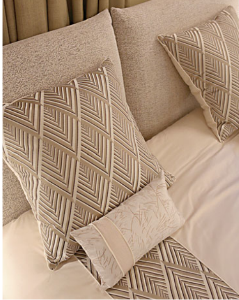
En-tête - designed by Studio Roche Bobois Bed for 160 x 200 cm mattress size