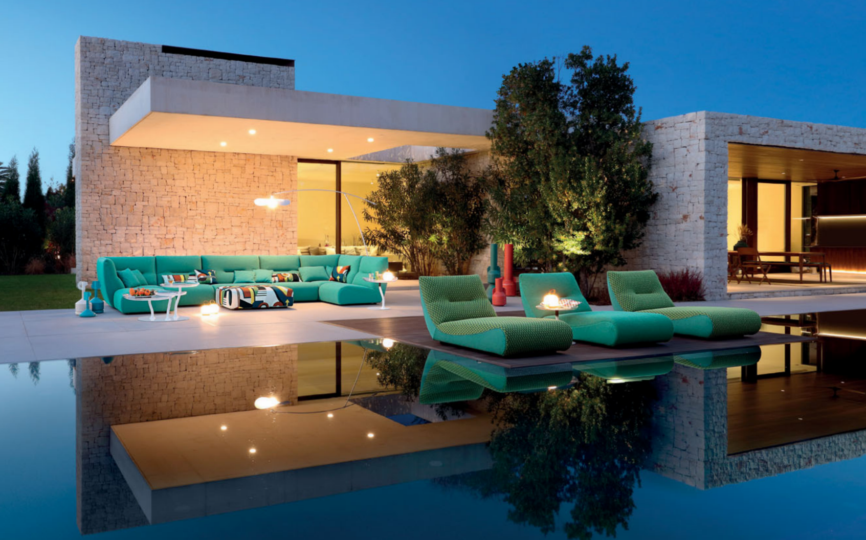
Temps Calme Outdoor - designed by Studio Roche Bobois Modular sofa for outdoor