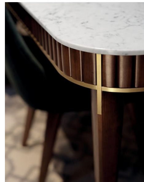
Stained solid cherry wood structure. Brushed brass trims and feet.