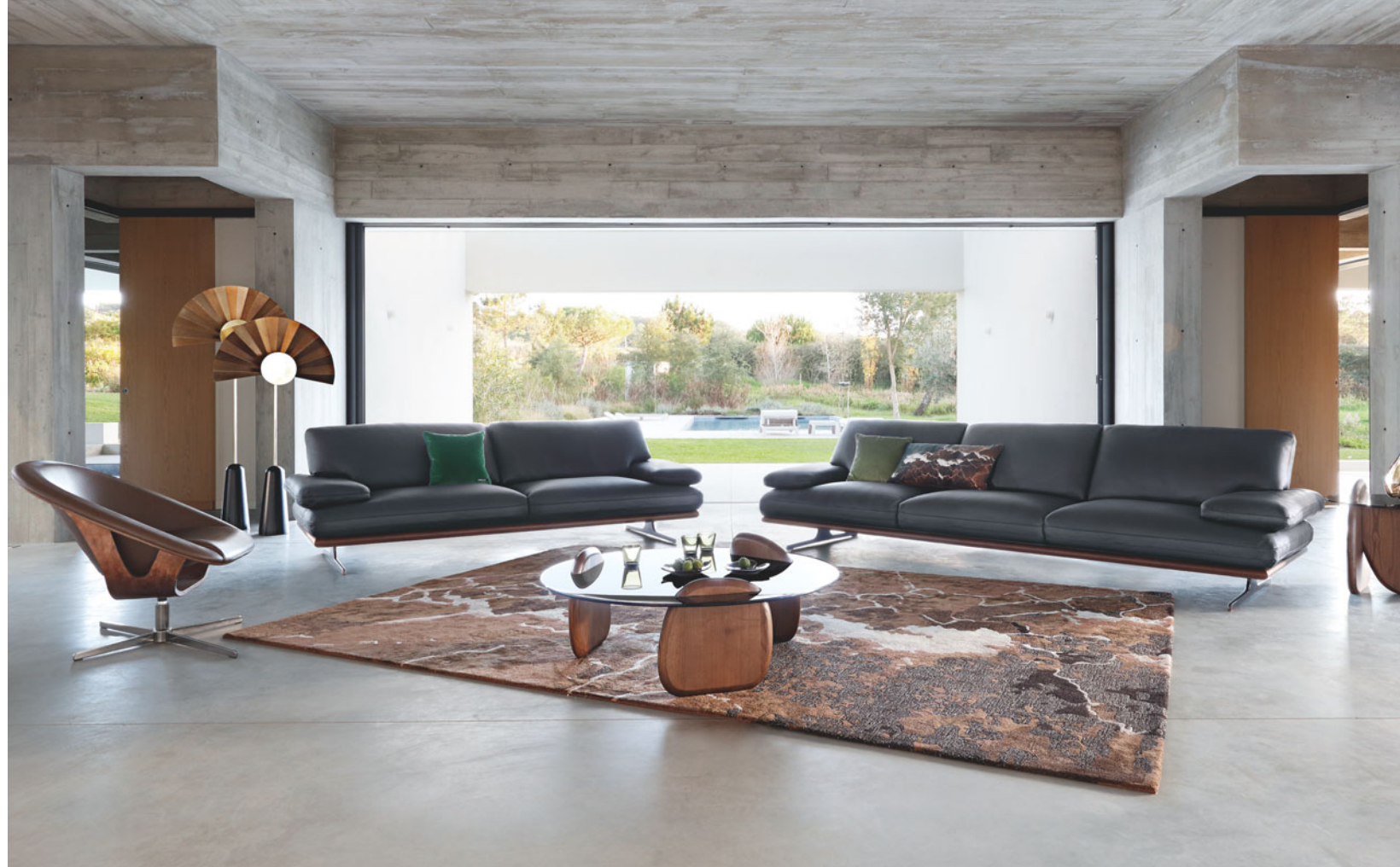
Envergure - designed by Philippe Bouix 5-seat sofa

The Pulp dining table and chair have the FSC™ 100% label: the wood comes from FSC™ certified forests well managed.