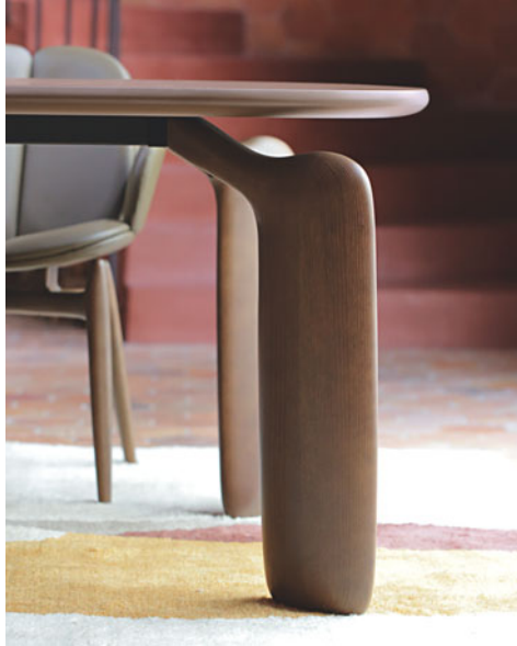
Pulp - designed by Eugeni Quitllet Dining table