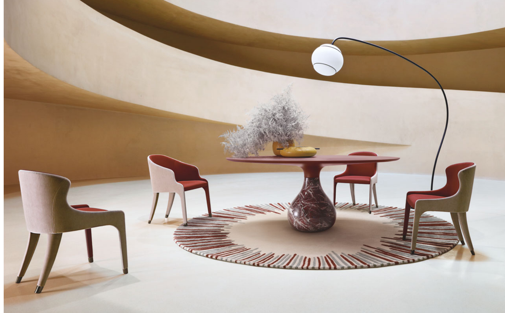
Aqua - designed by Fabrice Berrux Dining table with marble base, limited edition: 200 pieces