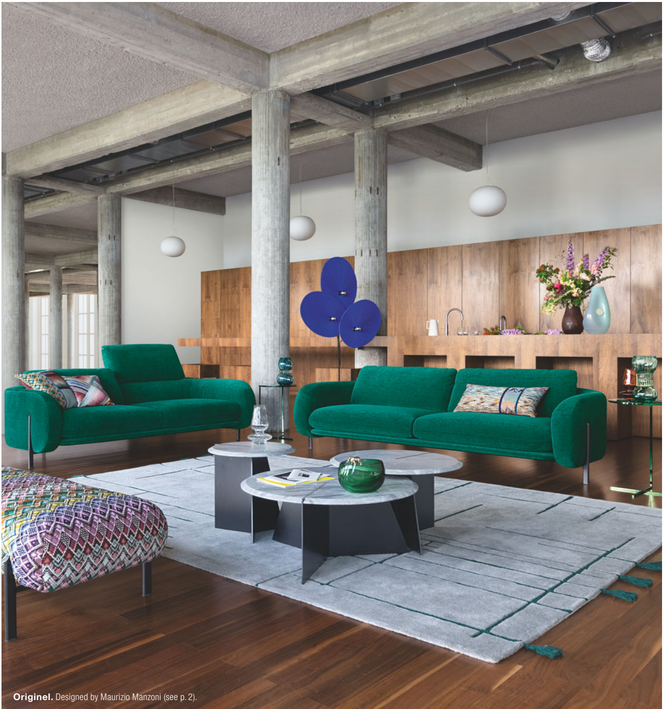
Original. Designed by Maurizio Manzoni (see p. 2).