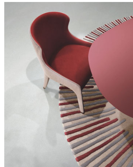
Steeple - designed by Enrico Franzolini

Dining armchair with structure in solid beech and plywood, padded and upholstered in fabric, leather or leather-like technological fabric (many colours available). Leg base: chrome-plated, black chrome-plated or golden. L. 56 x H. 77 x D. 58 cm. Made in Europe.