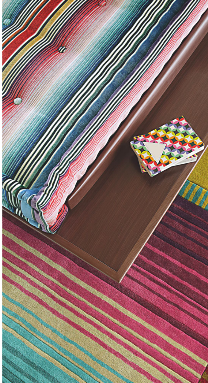
Mah Jong - designed by Hans Hopfer Modular sofa with elements, upholstered in Misوني Home Collection fabrics, platforms in stained wood, Alezan finish