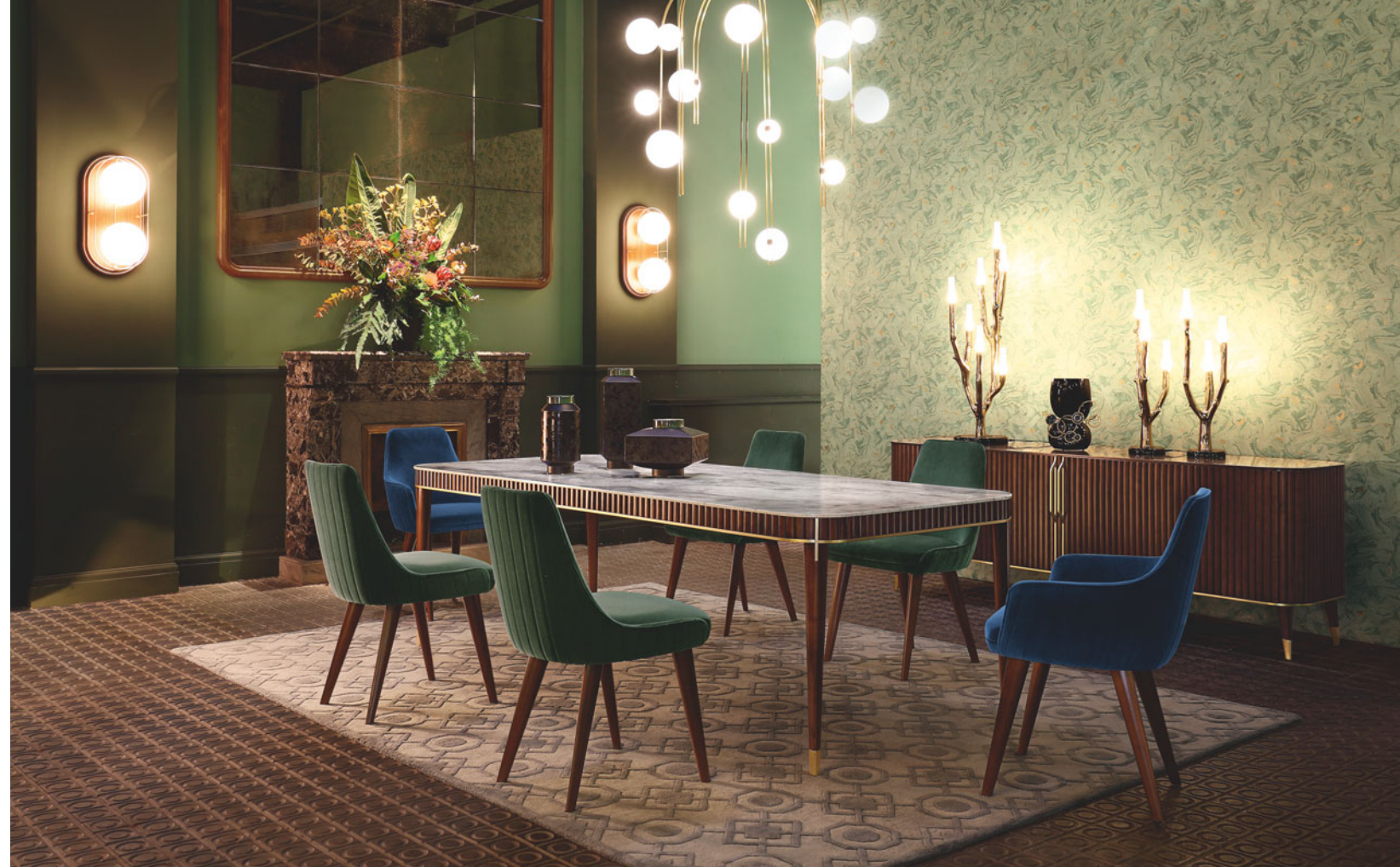
Eden Rock - designed by Sacha Lakic Dining table, Carrara marble top