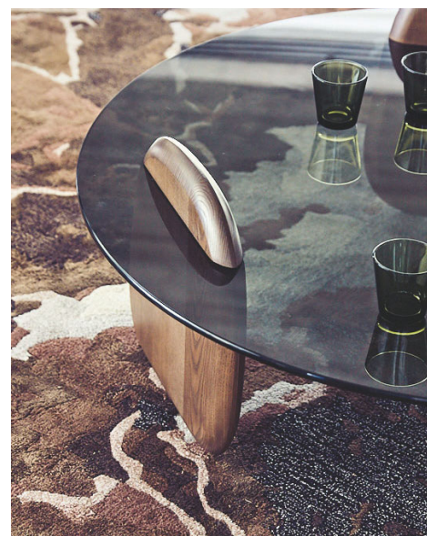
Shark - designed by Studio Juam

Cocktail table made with bases in stained solid ash (several colours available) and top in 10 mm-thick grey smoked glass. Ø. 110 x H. 33 cm. End table version also available: Ø. 60 x H. 46 cm. Made in Europe.