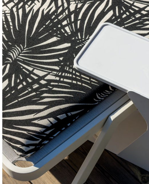
Sunset - designed by David Rockwell Lounge chairs