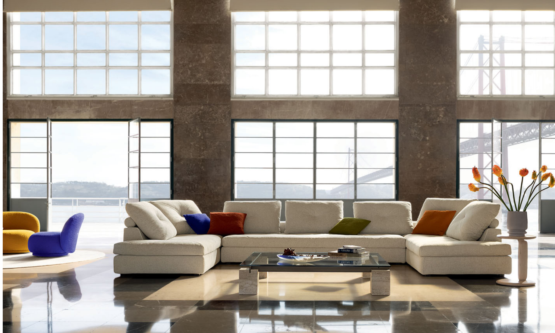
Préface - designed by Philippe Bouix Modular sofa