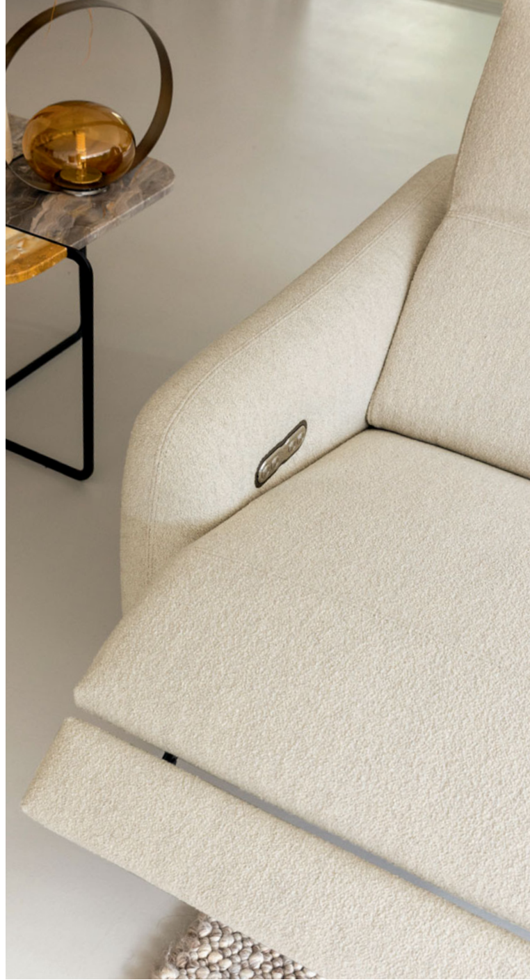
Opale - designed by Maurizio Manzoni Modular sofa with multi-position electric mechanism