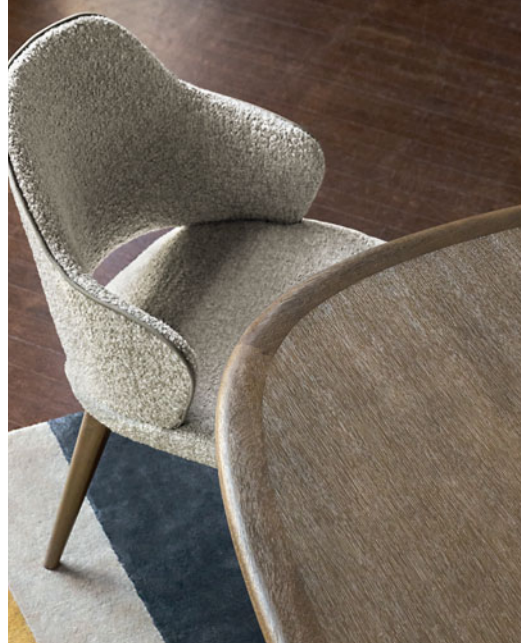
Rio Ipanema - designed by Bruno Moinard Dining table in solid oak