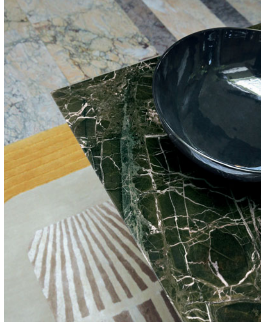
Serpentine - designed by Fabrice Berrux Dining table, top in Verde Levanto marble