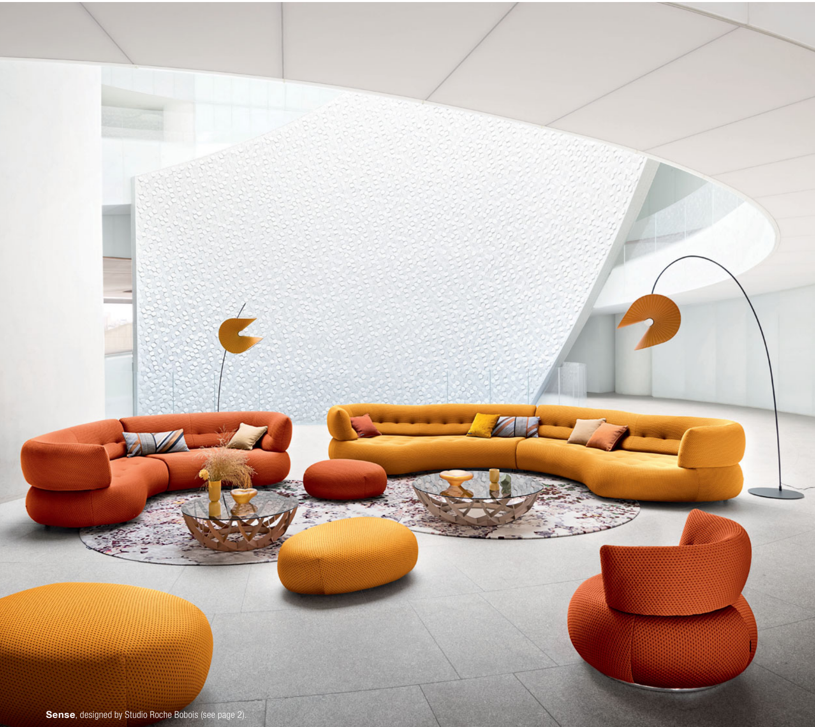
Sense , designed by Studio Roche Bobois (see page 2).