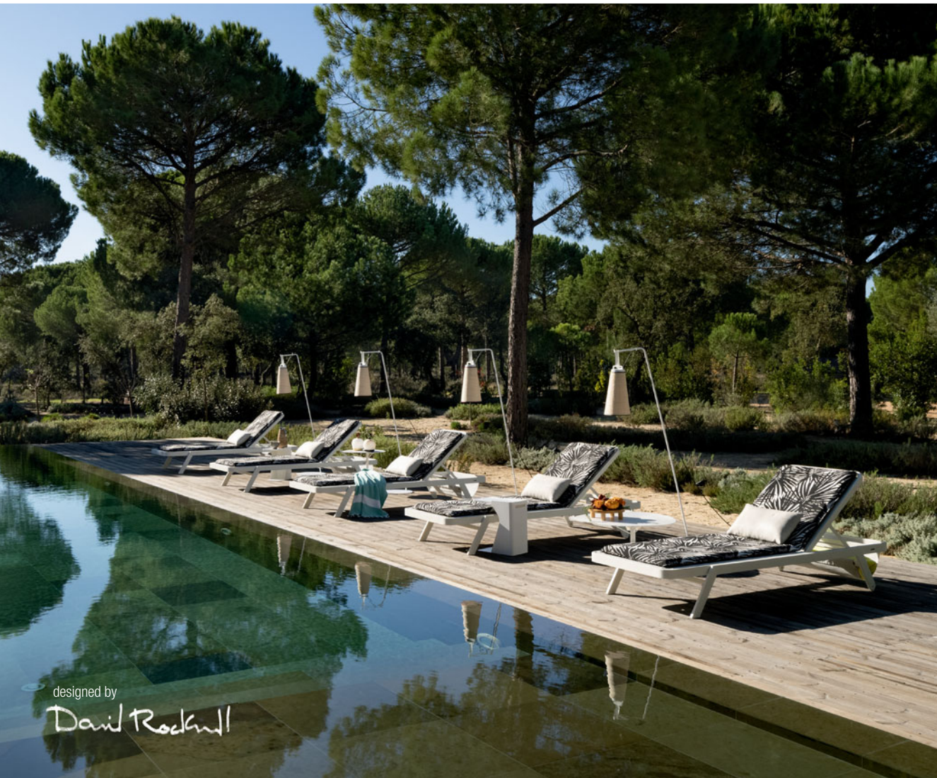
designed by David Rockwell