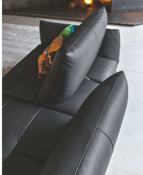
Double-depth backrests with reclining mechanism.