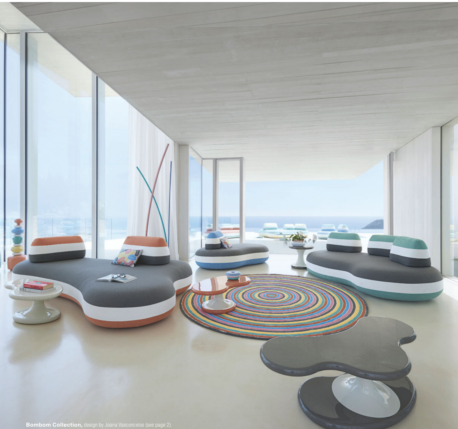
Bombom Collection, design by Joana Vasconcelos (see page 2).