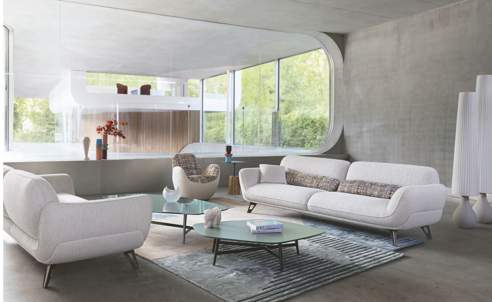
Allusion - design by Sacha Lakić Large 3-seat sofas