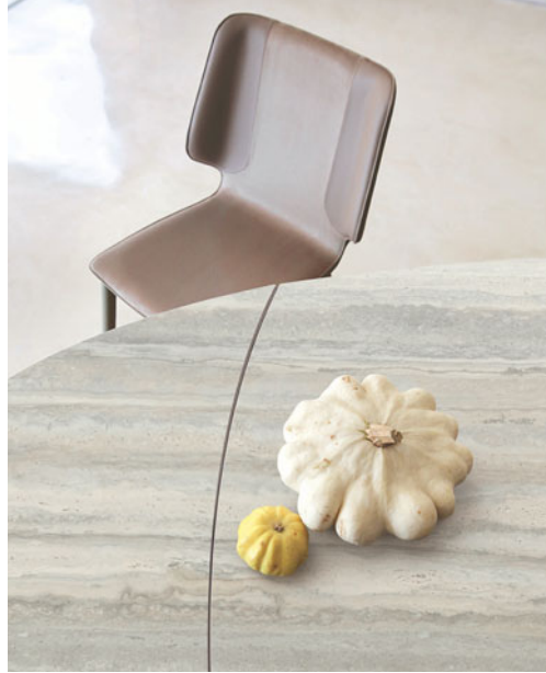
Alliage - design by Andrea Casati Dining table with integrated extensions, ceramic and glass top