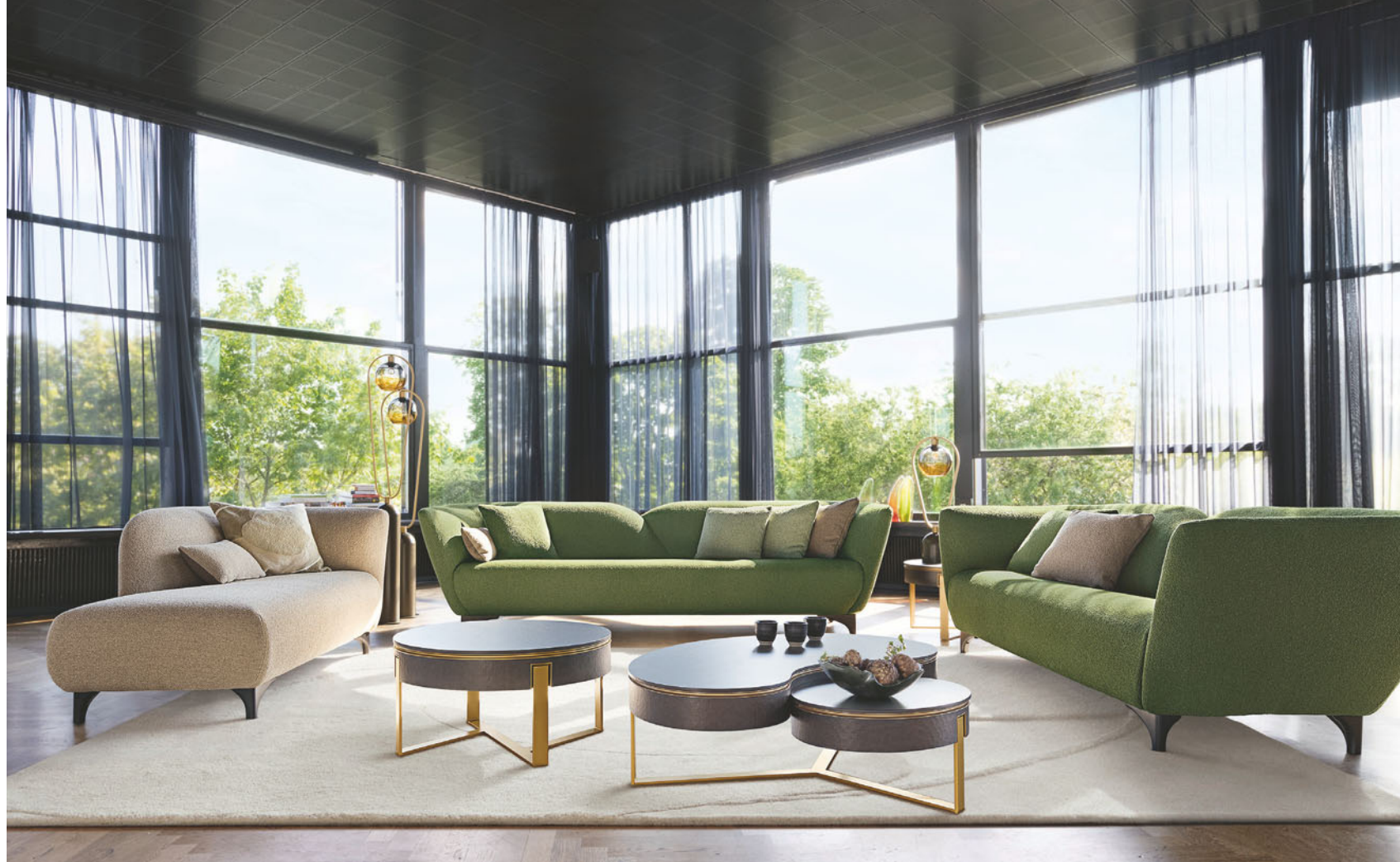
Perle - design by Bina Baitel Fabric sofas and meridiene