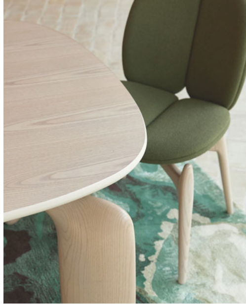
Pulp - design by Eugeni Quitllet Dining table