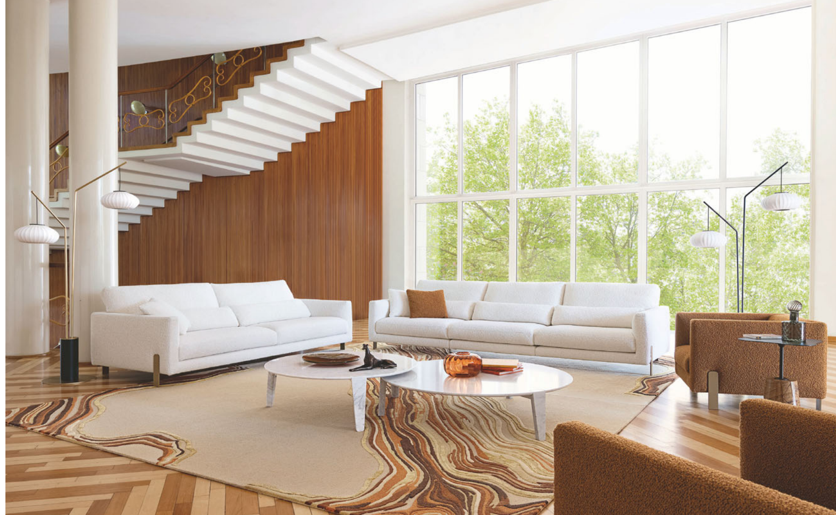
Intervalle - design by Studio Roche Bobois Fabric sofas