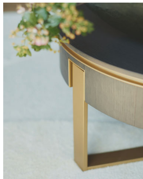
Perle. Sofas and meridiene, upholstered in Orsetto fabric. W. 240 x H. 75 x D. 92 cm. Base in solid ash with a wenge stain. Other dimensions available. Réminiscence coffee tables, designed by Bina Baitel. Luna floor lamps and table lamp, designed by Pierre Dubois & Aimé Cécil. Made in Europe.