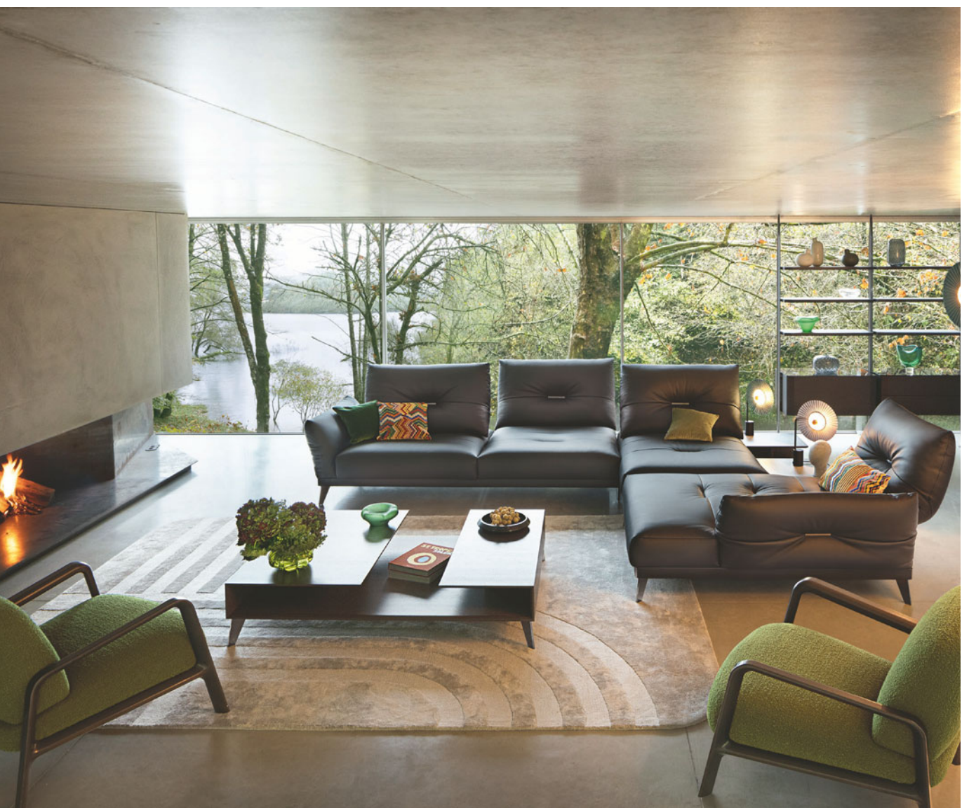
Itinéraire - design by Philippe Bouix Modular sofa in leather, mechanically operated double-depth backrests