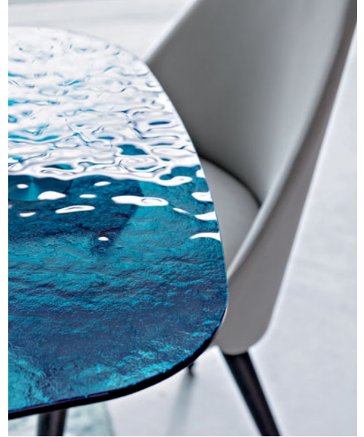
Iroise - designed by Studio Roche Bobois Dining table, colored bubble glass top *$8,490 instead of $10,490