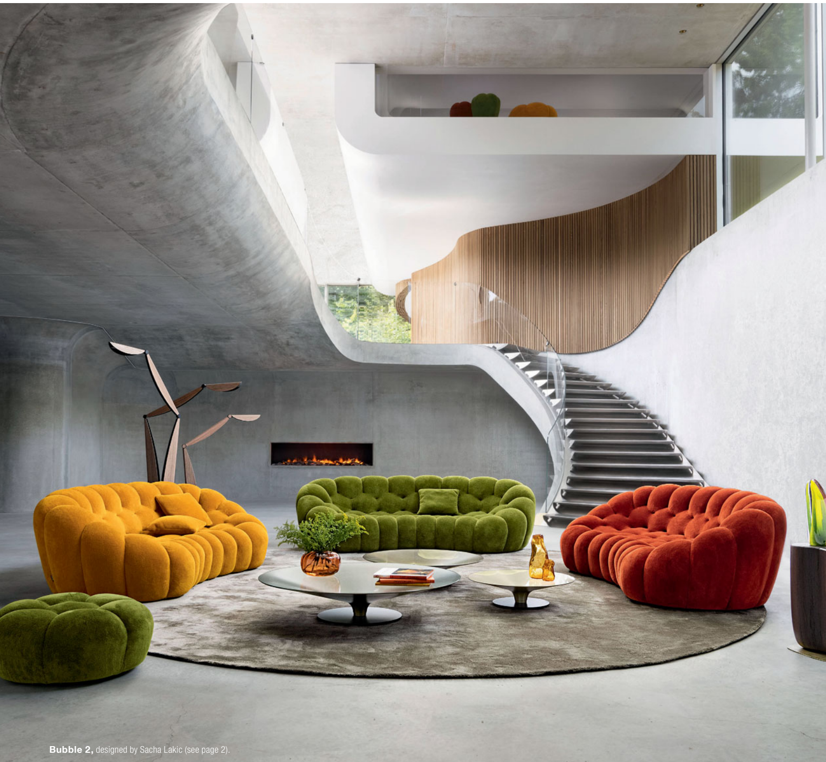
Bubble 2, designed by Sacha Lakic (see page 2).