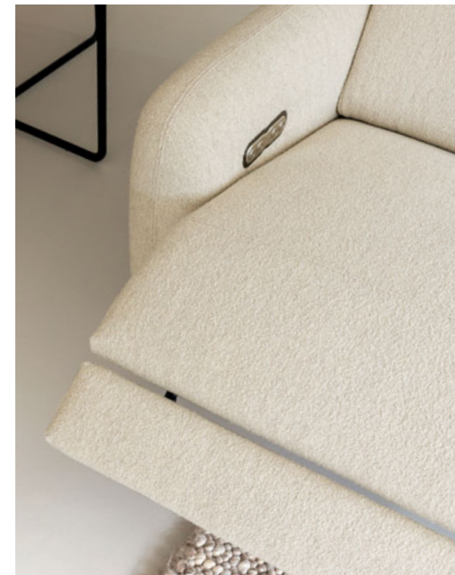
Adjustable backrests with black chromed-plated reclining mechanism.

Opale. *$9,990 instead of $12,990 until 10/31/23 for a sofa as shown, 86" L. x 28.3/38.6" H. x 44.9" D. Price includes one sofa upholstered in Ricochet fabric, with a multi-position electric mechanism that turns each seat into a lounge chair - 2 motors per seat. Digital control unit embedded in the armrest. Other dimensions available. Optional throw cushions. Dolomie cocktail table and pedestal tables, designed by Efreem Bonacina & Grete Macri. Annapurna floor lamps, designed by Fabrice Berrux. Made in Europe. Nadia rug.