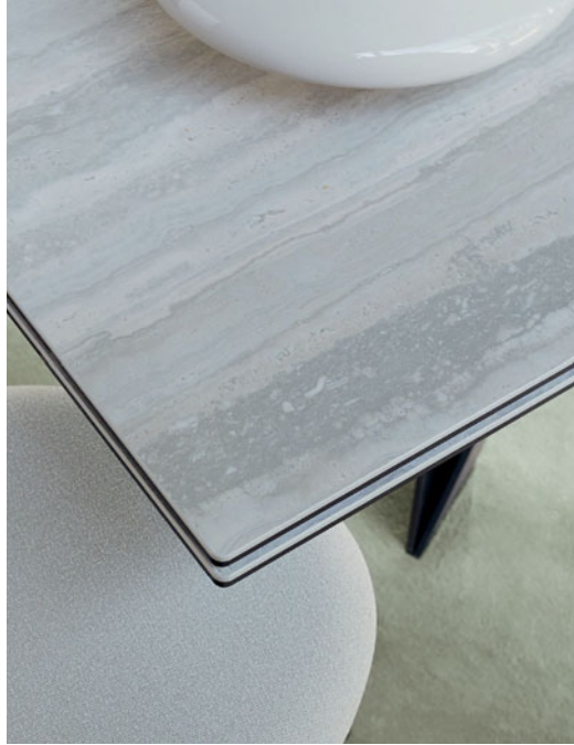
Cigale – designed by Andrea Casati Dining table with integrated extensions, glass and ceramic top