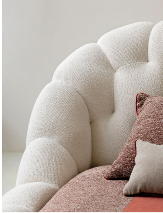
Bubble – designed by Sacha Lakic Fully tufted bed