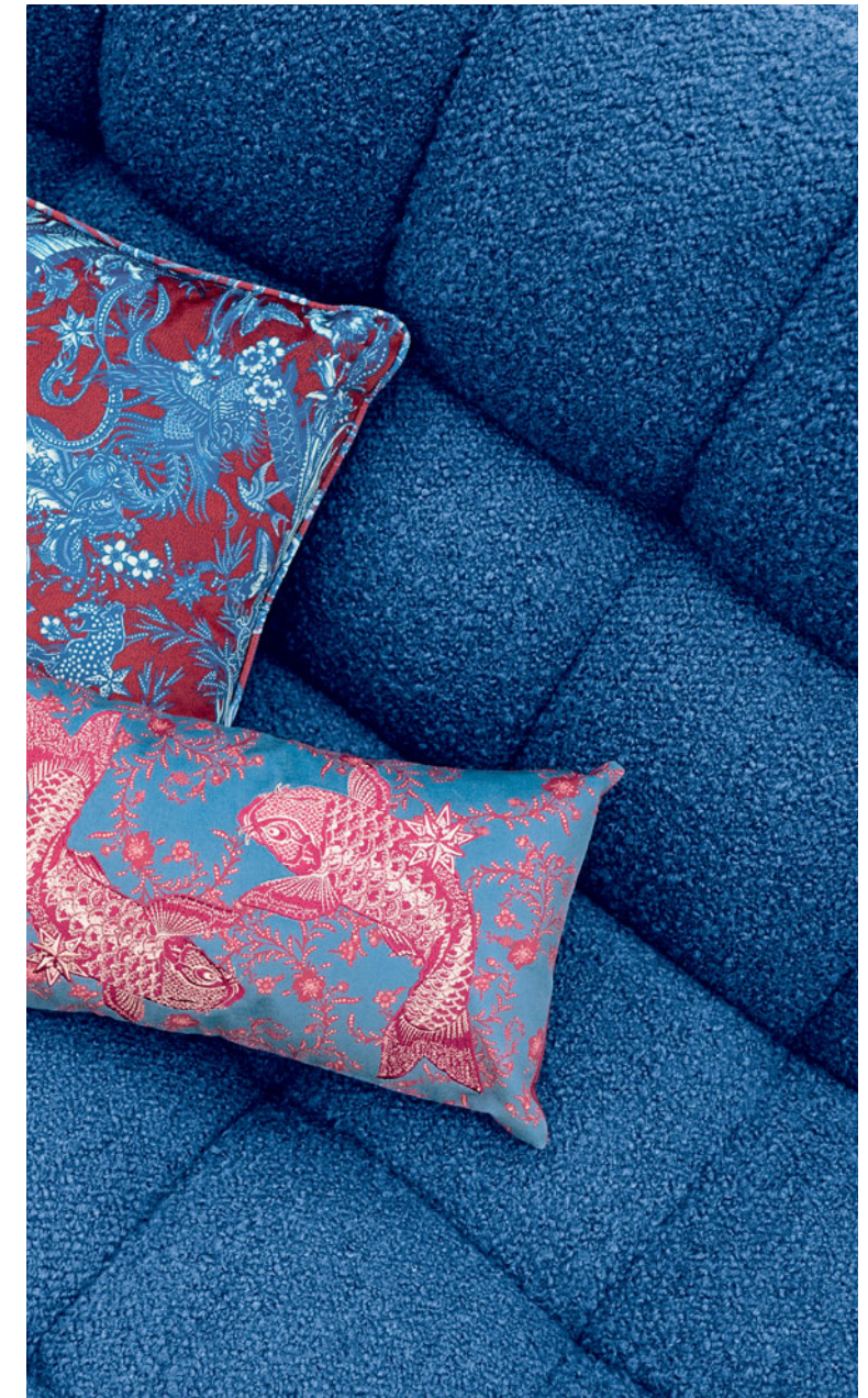
Setup – designed by Sacha Lakic Eco-designed, fully recyclable modular sofa

Sofa upholstered in Smile Flex fabric. W. 235/421/235 x H. 83 x D. 108 cm. Fully tufted. Metal frame. Elastic straps suspension. Other dimensions available. Chess occasional tables, designed by Marcel Wanders. Chroma floor lamp, designed by Arturo Erbsman. Made in Europe. Cordouan rug, designed by Jean Paul Gaultier.