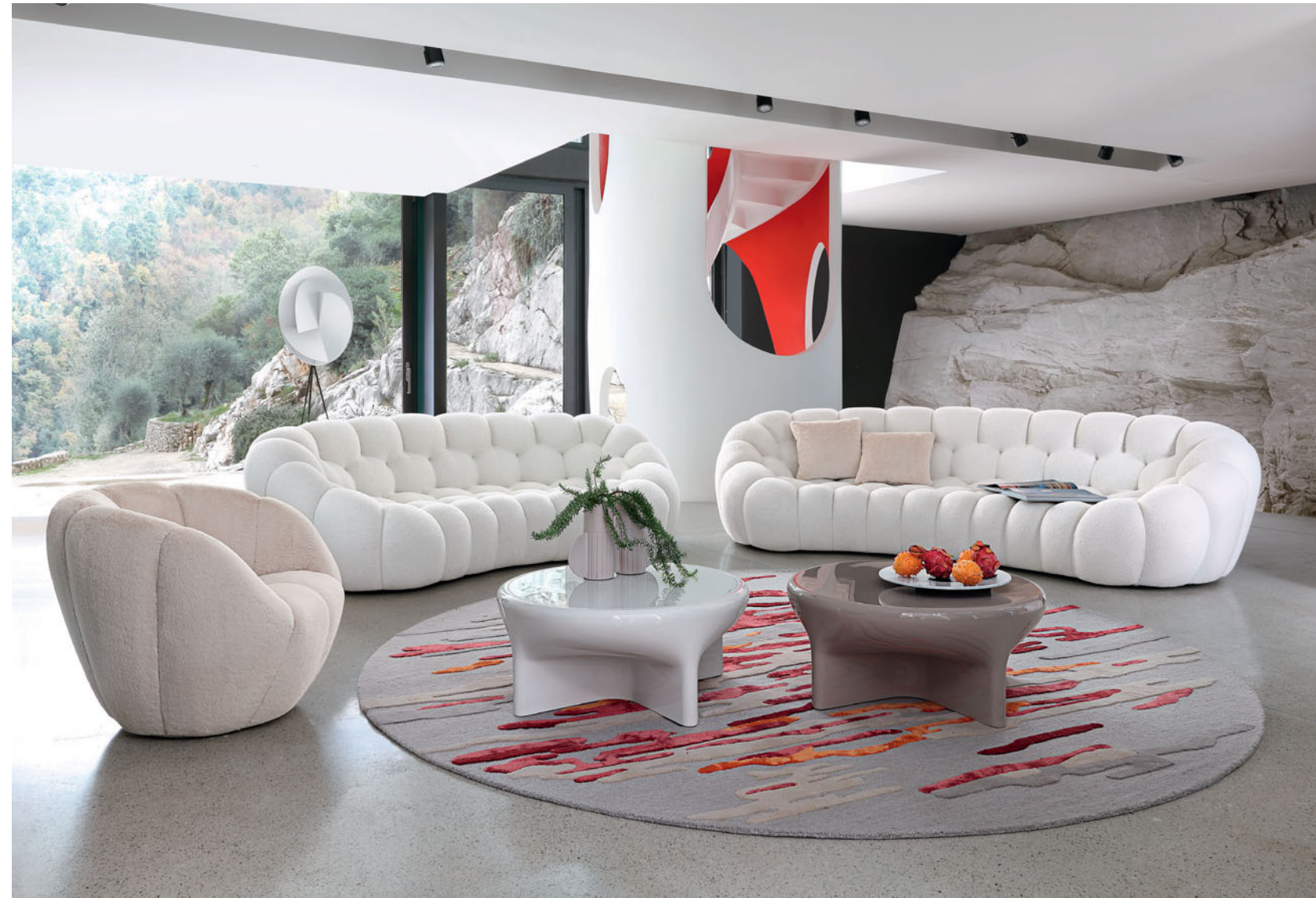
Bubble 2 – designed by Sacha Lakic Curved 3-4 seat sofa

This bed's frame is made with FSC®-certified mixed wood. It is made with a mixture of materials from responsibly managed, FSC®-certified forests and from other controlled sources.