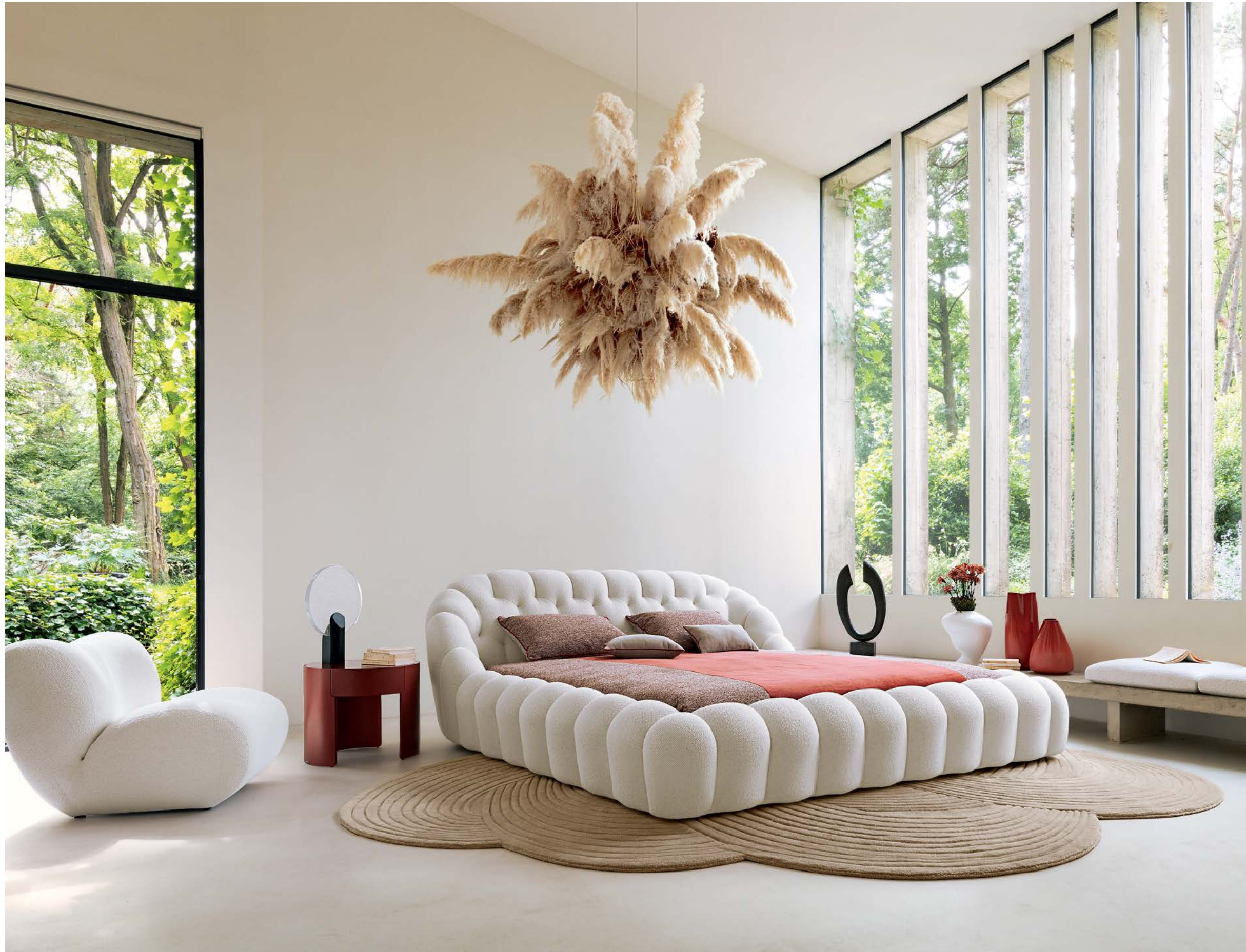
Bubble - designed by Sacha Lakic Fully tufted bed