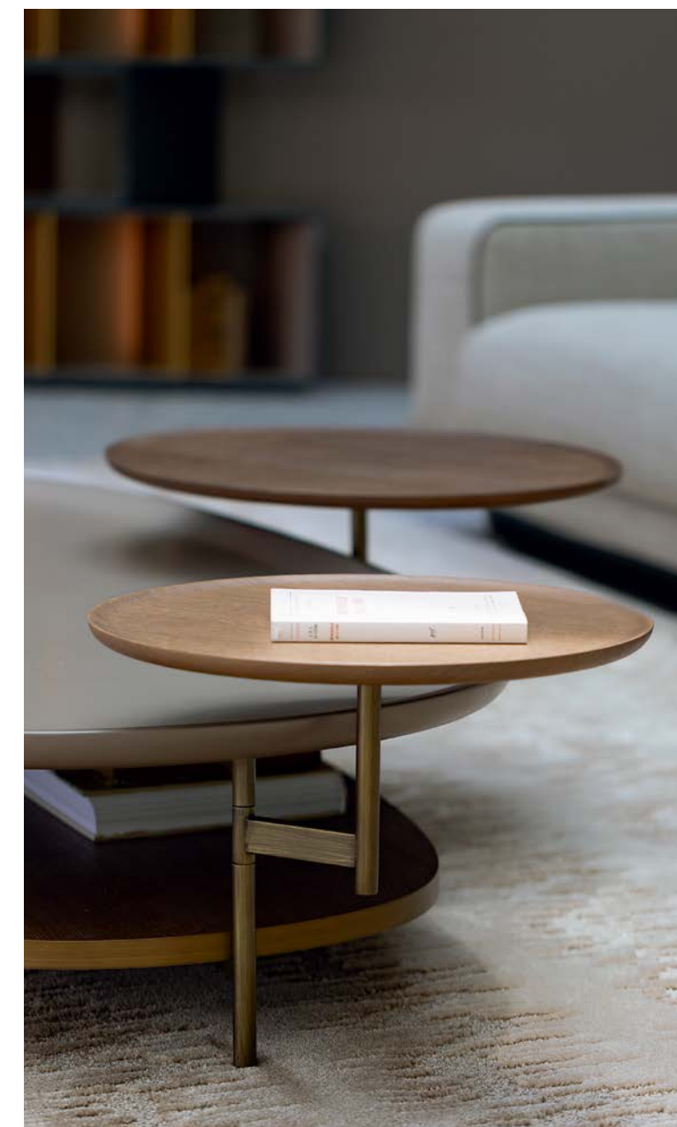
Altéa - designed by Philippe Bouix Large 3-seater sofa