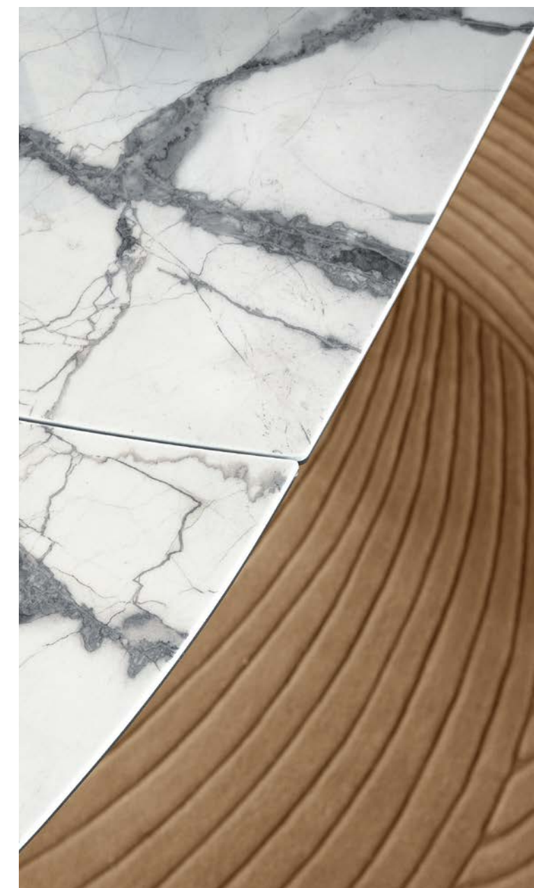
Deltalis - designed by Maurizio Manzoni Dining table with integrated extensions, glass and ceramic top