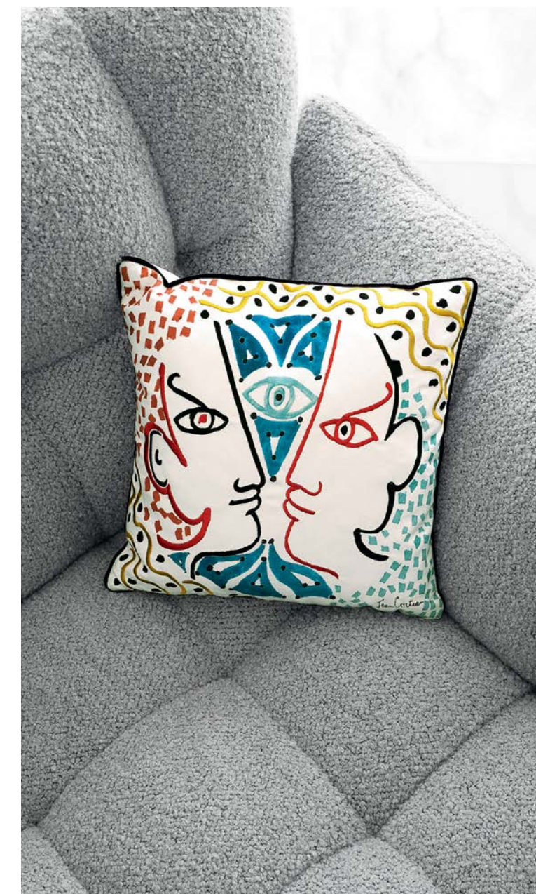
Jean Cocteau cushion collection.

Setup - designed by Sacha Lakic Large, fully tufted 3-seater sofa