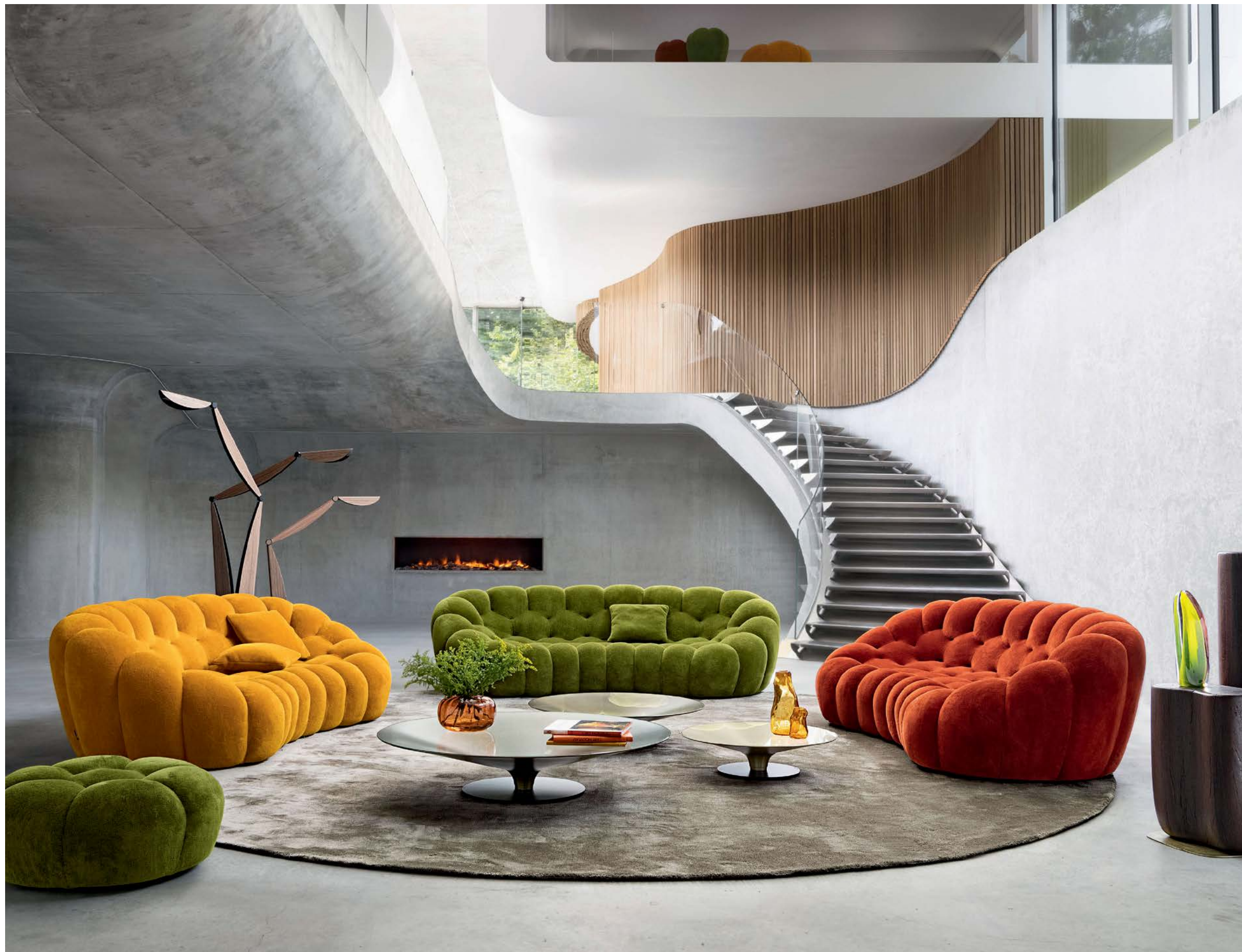
Bubble Curve - designed by Sacha Ladic Rounded 3 to 4-seater tufted sofa

Sofa. Eco-designed. W. 248 x H. 80 x D. 132 cm. Upholstered in Passion fabric. Fully tufted. Other dimensions available. Ovni Up coffee tables, designed by Vincenzo Maiolino. Rio Ipanema pedestal tables, designed by Bruno Moinard. Oiseau floor lamps, designed by Sean Connors. Made in Europe. Silky rug.