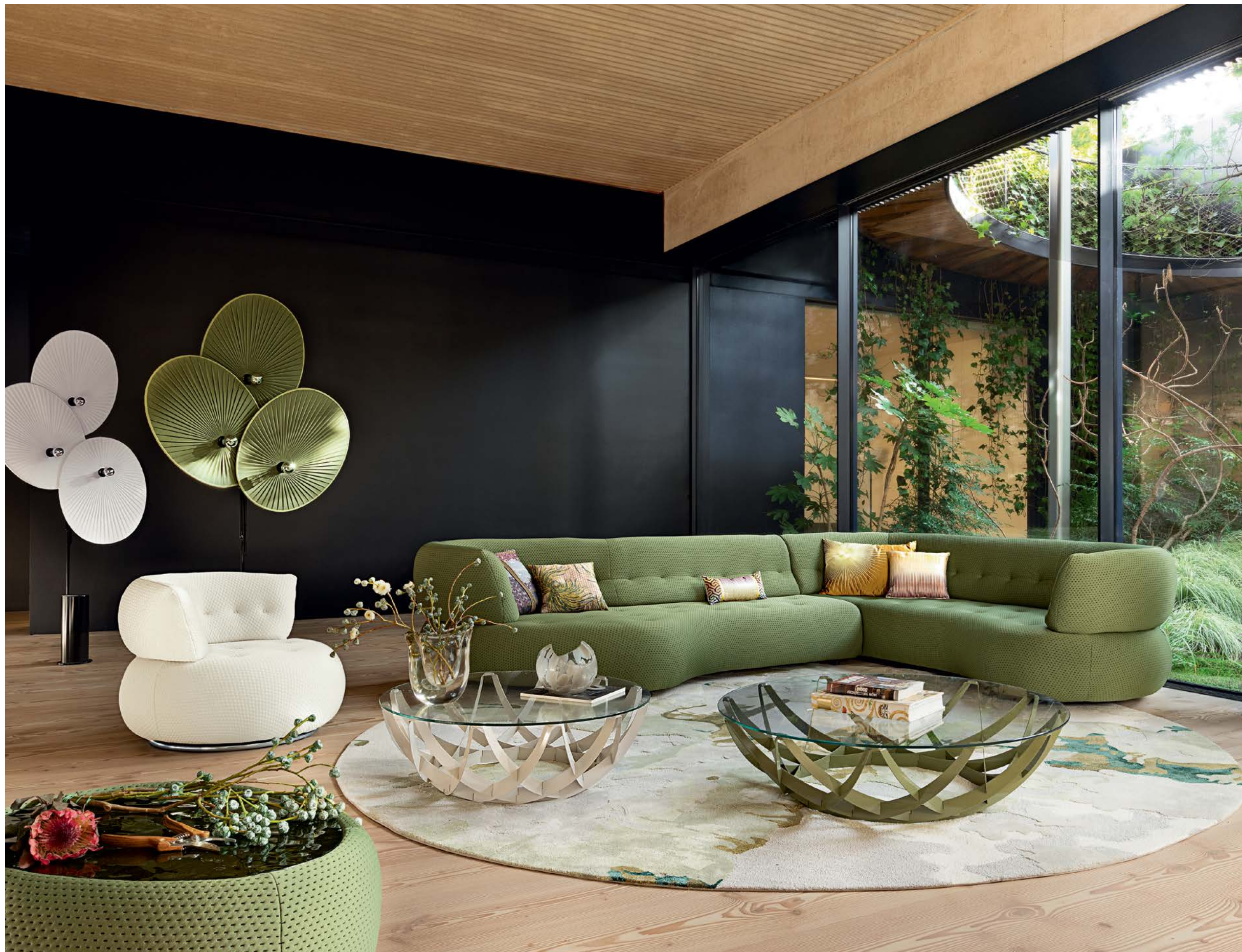
Sense - designed by Studio Roche Bobois Modular sofa