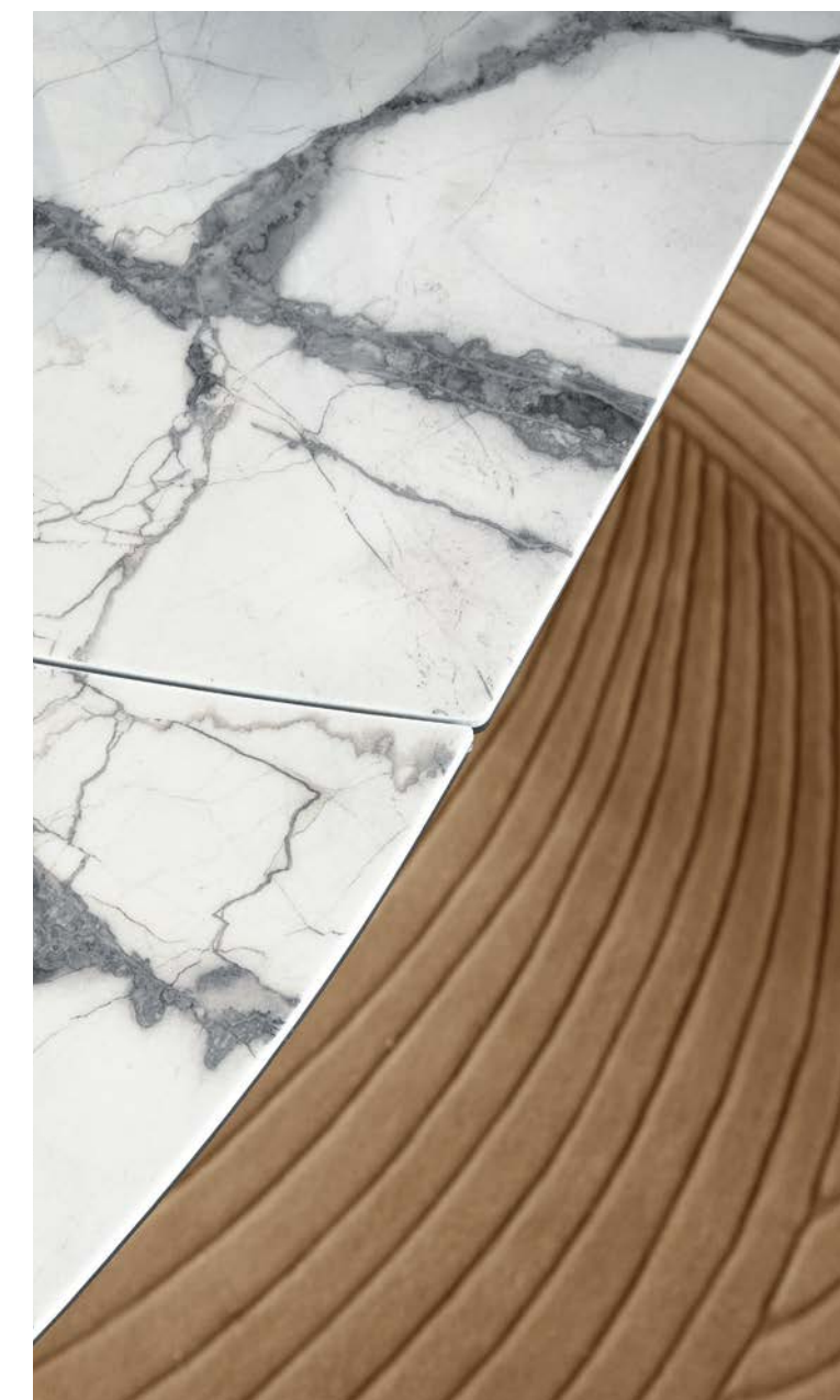
Deltalis - designed by Maurizio Manzoni Dining table with integrated extensions, glass and ceramic top